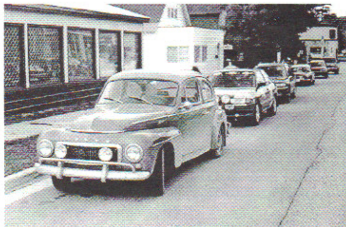
Unlikely cast of characters prepares for "day" two. Volvo 544 Sport, Escort GT, Subaru Outback, MGB.