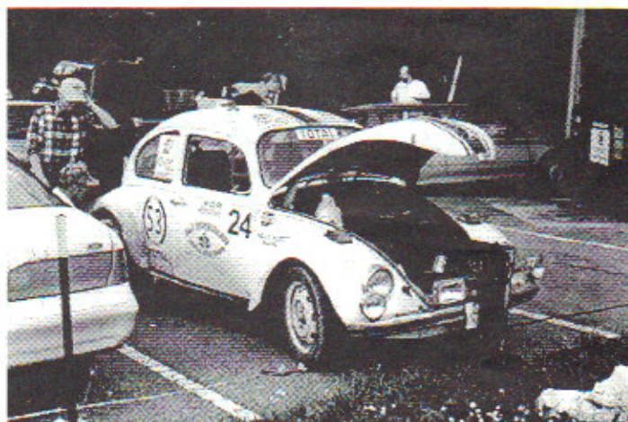
"Herbie" gets a little TLC before hitting the road on day two.