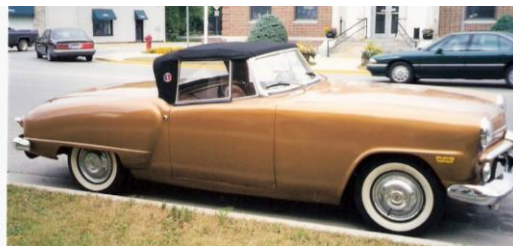
The Winning Car of the First POR

Press On Regardless® first ran in 1949, with entries including an SS100 Jaguar and a 1936 Duesenberg. That first POR started in Dearborn, and took competitors to Battle Creek and Flint before returning to the start. The first winners drove a 1949 Studebaker. Since that first presentation, POR has been a unique event, going from an SCCA-sanctioned National Rally, to a “brisk” 24 hour Time-Speed-Distance event and then to a closed road performance event patterned after the European Championship rallies. After several years as a FIA listed event, it became the first World Rally Championship Rally in the United States in 1972. When SCCA initiated the Pro Rally series, POR joined that series and was generally considered not only the oldest but also the longest, toughest and meanest event on the schedule. Finally, in 1994, the Detroit Region decided to return the event closer to its roots, and it once again became a TSD event.